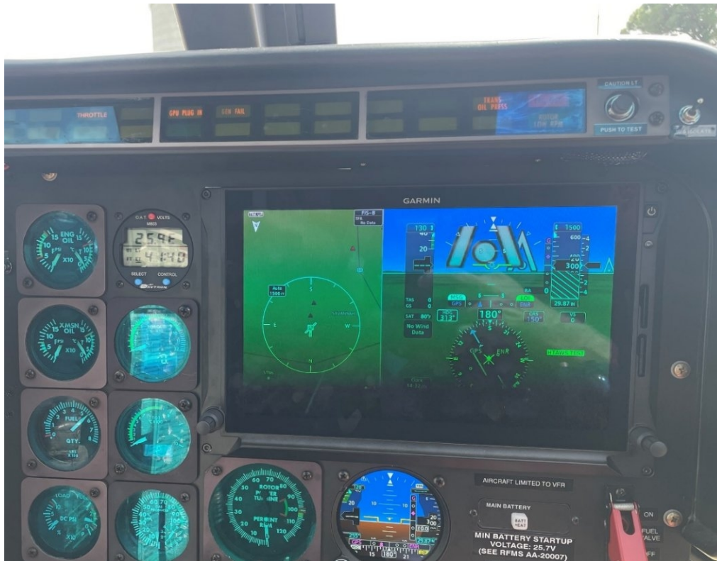
Figure 2 - Exemplar of instrument panel as configured in accident helicopter.

The wreckage was examined at the accident site on and all major components of the helicopter were accounted for at the scene. The fuselage came to rest on its left side about 670 ft beyond the base of the tower on an approximate azimuth of 220° and was destroyed by impact and fire. The tailboom remained attached but was deformed by impact and fire. The tailrotor and tailrotor gearbox were separated from the airframe as a unit and found entangled in the wreckage. One blade was separated from its grip and damaged by fire.